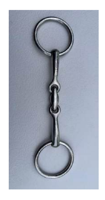
Silver coloured Korsteel 5" snaffle $40

Sue Thurlow has some good quality bits for sale – contact her on 0407 371 681