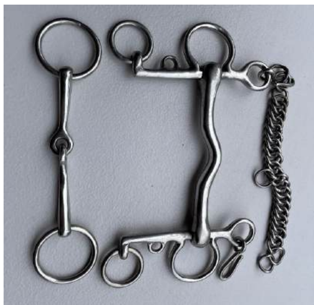
Stainless Steel Double bits + chain 4.5" Bradoon & 5" Weymouth $50

Sue Thurlow has some good quality bits for sale – contact her on 0407 371 681