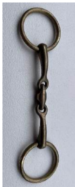
Brass coloured Korsteel 5" snaffle $25