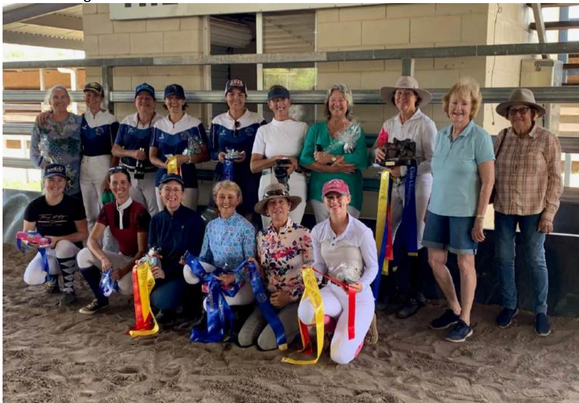
Winners, Judges & Committee members