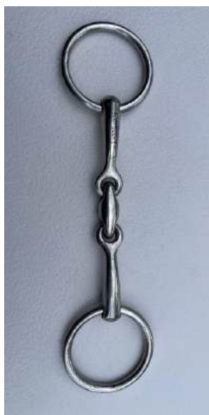
Silver coloured Korsteel 5" snaffle $40

Sue Thurlow has some good quality bits for sale – contact her on 0407 371 681