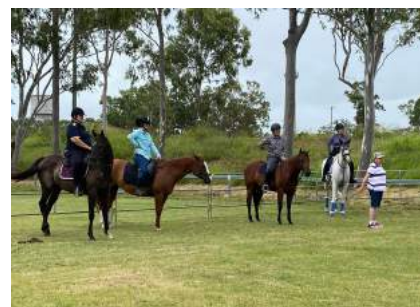
Happy groups of riders