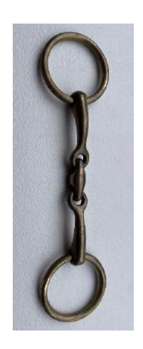
Brass coloured Korsteel 5" snaffle $25