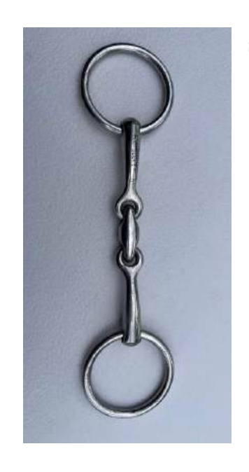
Silver coloured Korsteel 5" snaffle $40

Sue Thurlow has some good quality bits for sale – contact her on 0407 371 681