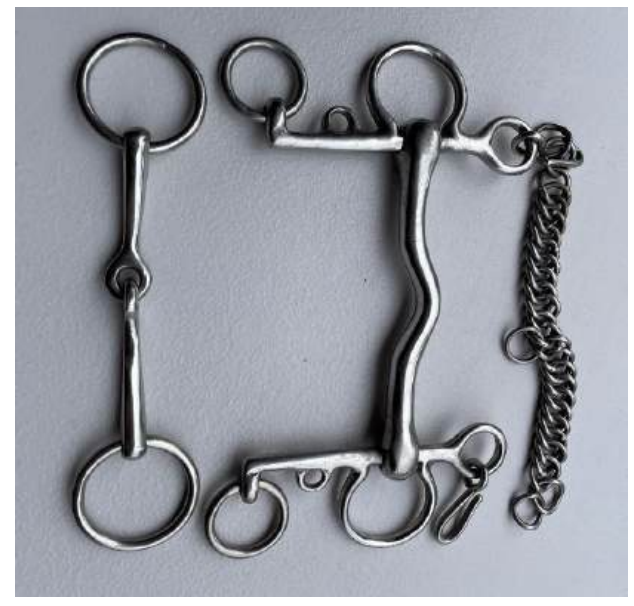
Stainless Steel Double bits + chain 4.5" Bradoon & 5" Weymouth $50

Sue Thurlow has some good quality bits for sale – contact her on 0407 371 681